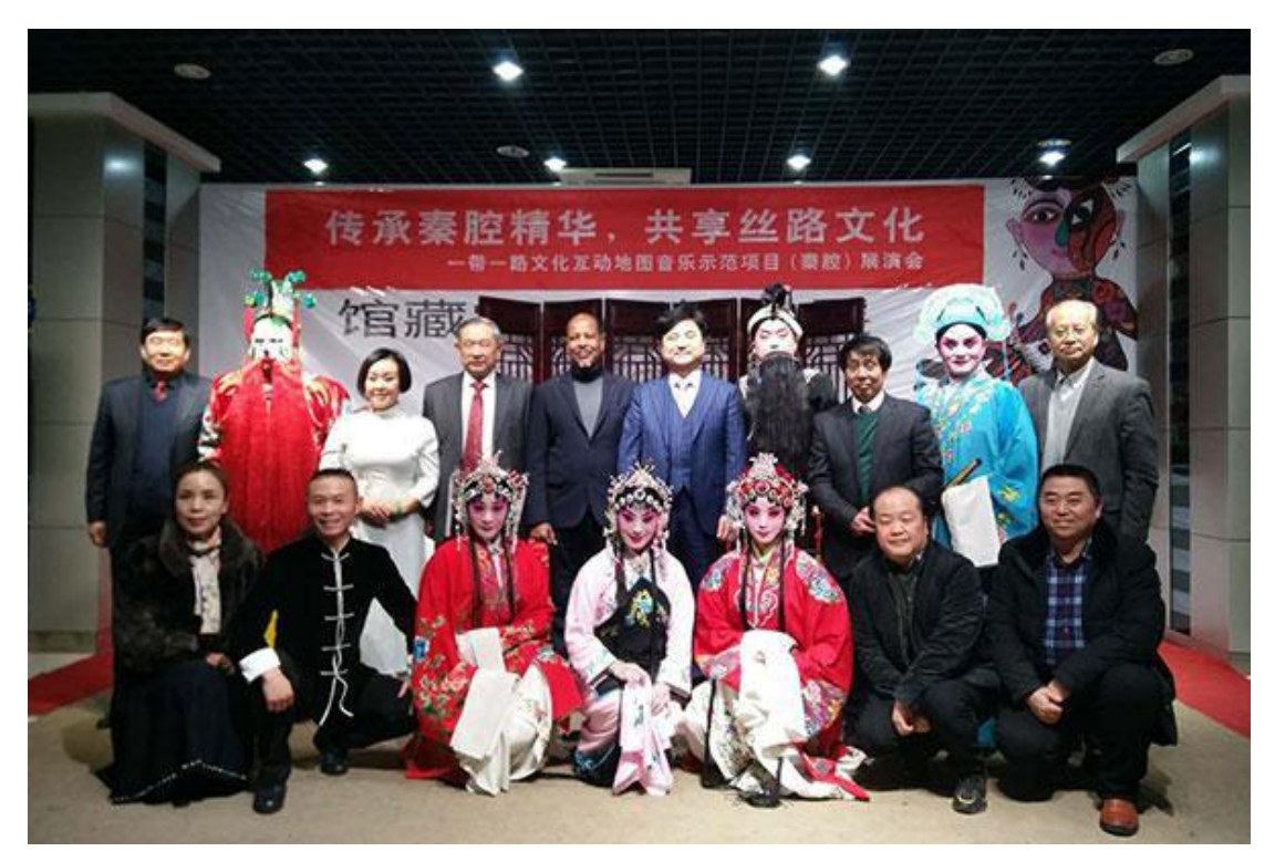
Supporting the Establishment of AI Culture R&D Institution in Xi'an