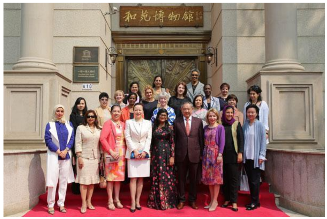
Twenty-two spouses of Ambassadors participating in the Silk Road Tea Ceremony in the Peace Garden Museum

A powerful nation needs philosophy when facing with the complex international environment. While its comprehensive national strength develops to a certain level, it should put more efforts to improve the soft power, including people's diplomacy, multiculturalism and social responsibility. Only by grasping the tools to understand the world well can we gain power to transform the world, thus to make breakthroughs and development. The revival and prosperity of a city, the true integration of a local city on the international stage, and the transformation and upgrading of an industry all require a safe and friendly cultural mechanism. The imbalance of world political structure, the asymmetry of discourse power, the difference in population resources and quality, natural resources, energy and values, and even the distortion of moral consciousness would cause security crisis and have bad influence on people's happiness and the peaceful development of human life. International affairs follow the cycle of conflict and balance.