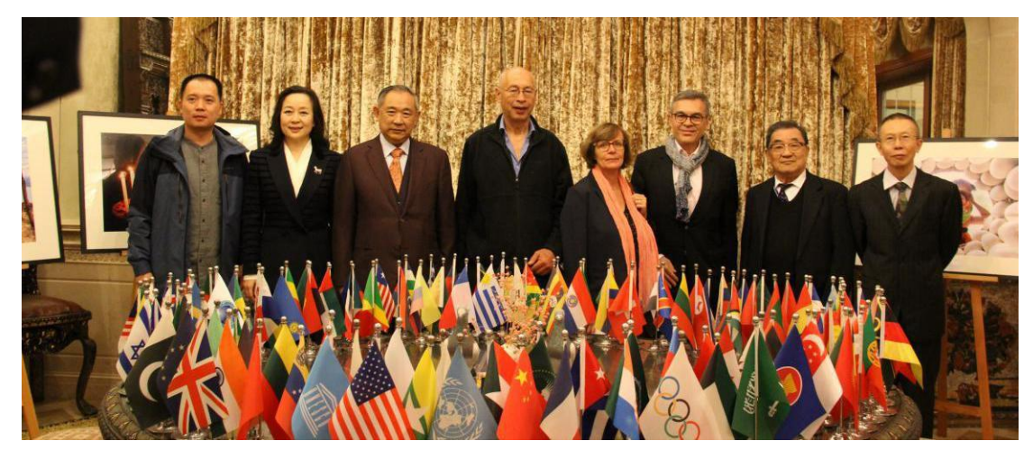
Deepening Reform and Opening Up while commemorating international friends

We have established friendly associations and organizations with more than 30 countries, including Morocco, Tunisia, Maldives, DPRK, ROK and Chile, and maintained a long-term mechanism for cooperation and exchanges by improving connectivity. We have also communicated with countries in the world that have not yet established diplomatic relations with our country, and supported the establishment of diplomatic relations between China and Dominica and Panama. A "Belt and Road Ambassador Village" seminar on cultural tourism of Israel and Jordan was held with China international friends Research Association, and a strategic cooperation agreement with Pakistan financial institutions was also reached.