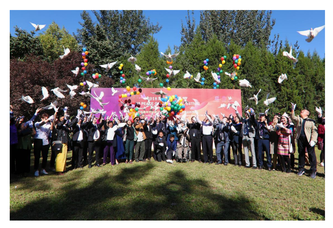
The foundation and UNESCO have worked together to hold the "Peace Garden Peace Festival" in four consecutive years