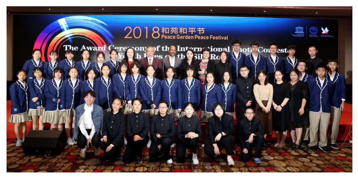
Group photo of volunteers at the Global Youth Photo Contest Awards Ceremony