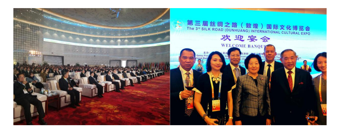
Signing cooperation agreement on Chinese medicine culture Under the "Interactive Atlas of Cultural Interactions along the Silk Roads" project with Gansu Provincial Government