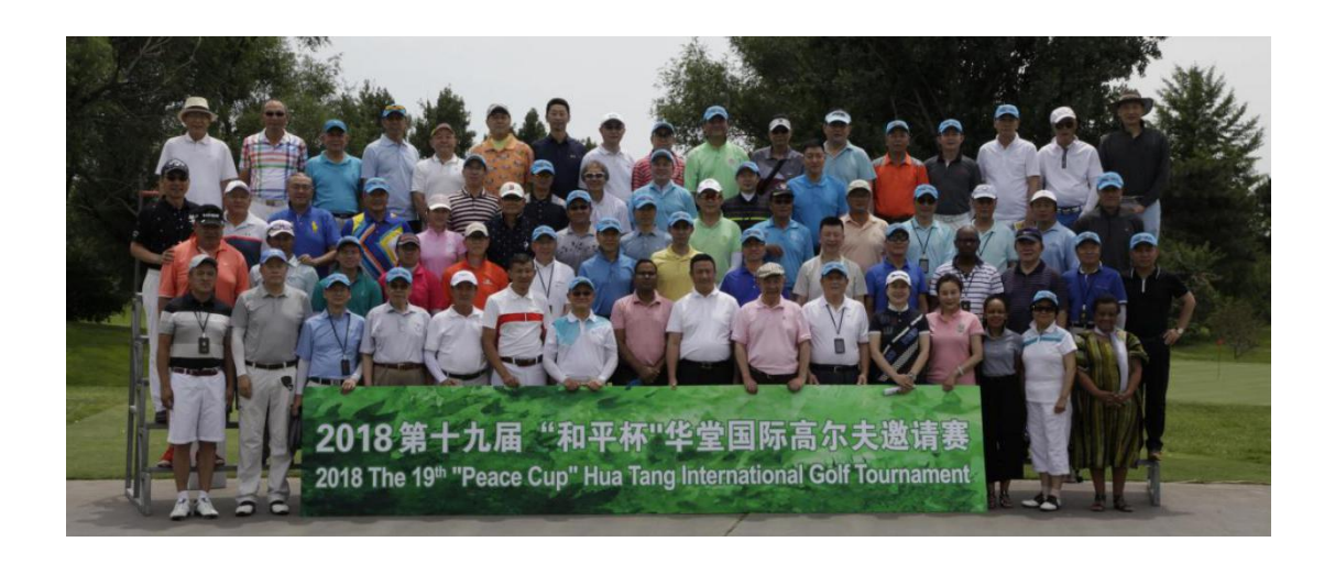
Peace Cup International Golf Tournament held in 19 consecutive years - A brand event for multinationals to support the improvement of business environment, public welfare and charities

At present, the whole country is carrying out poverty alleviation for three years through various ways, such as industry, culture and tourism, education, health, e-commerce and ecological, which has attracted worldwide attention. If such a grand and symbolic project that we are witnessing can provide reference to developing countries, it will be a gift to the world. To this end, we have strengthened cooperation with provincial offices in Beijing and chambers of commerce, and have repeatedly visited poverty-stricken areas to help the government tackle poverty. This year, we entered extremely poor schools in Shanxi, Gansu's Michang and Huining regions and made donations, provided audio books to their libraries. Two donations were made for Beijing 365 Morning Light Mental Disability School, including cash, printers, computers and other materials.